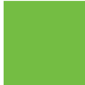
Teen Green Pantone 368 C CMYK: 65 0 100 0 RGB: 120 190 32 #78be20